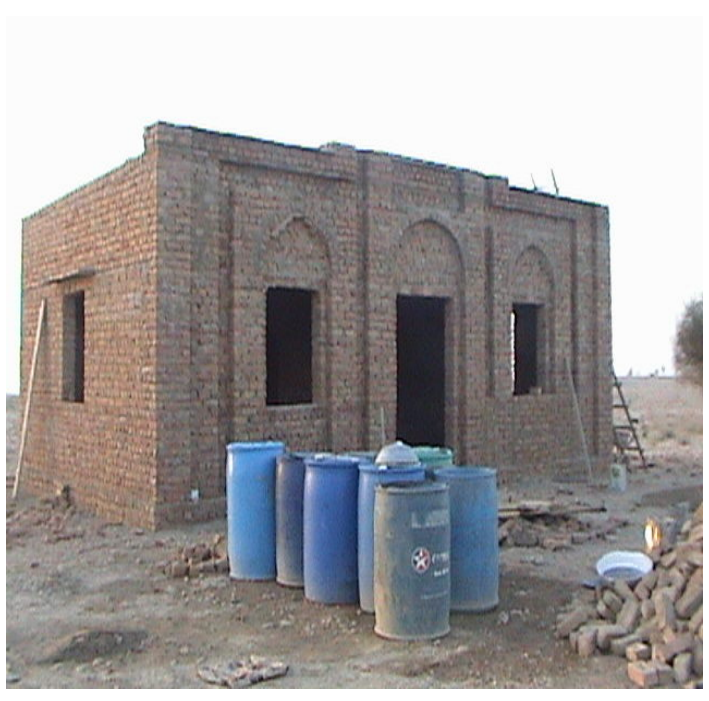
Under construction Mosque for Bado Jabal Villagers