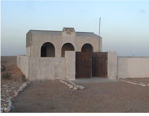
Bhitt Rural Support Program (BRSP) Community School for Kids

There is also a School name Bhitt Rural Support Program (BRSP) Community School for their kids. We also observed the construction of mosque which is in final stage.