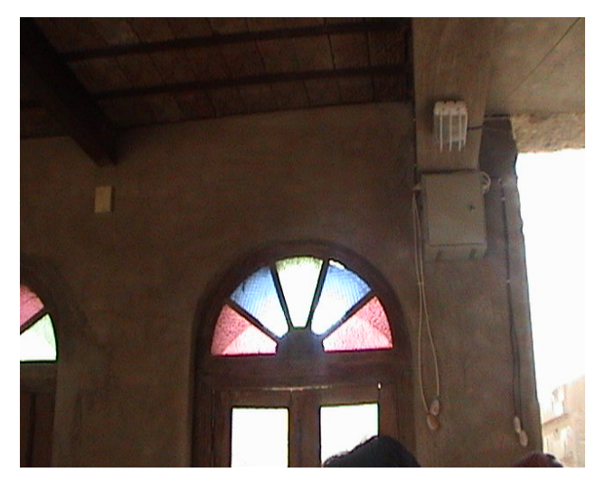
Installed Solar Controller at Dr. Mehdi's house

It was observed that panel wiring was wrong, few wire connection of controller were opened/broken, rest of the connection of Light and controller were directly connected without using fuse and the panel battery was dead. We replaced defective charge controller and rewired the unit.