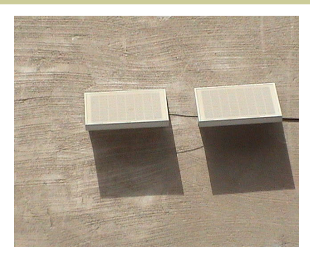
Dusty Solar Panel